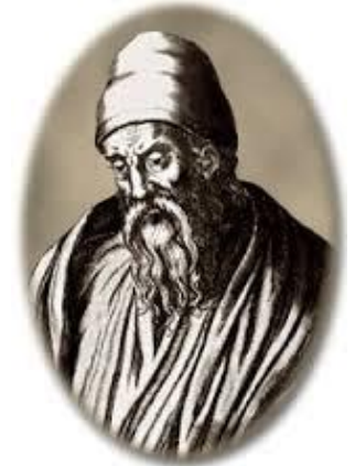
Euclid (325–265 BC)

Pi Mu Epsilon Portland State University Thursday, October 6, 2016